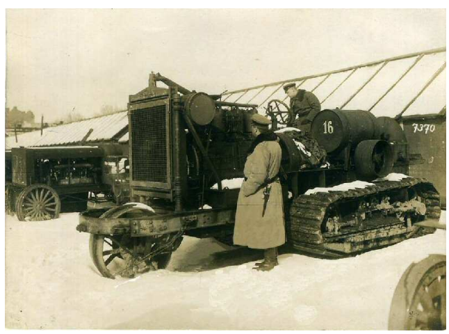
Holt tractor captured by German forces. Minsk, February 1918. Note Lombard tractor in background

In spite of the glowing praise orders placed by the Ouarter Master of the United States Army appear to be meager. In May 1918 twenty Lombard tractors, along with a six month supply of spare parts were awaiting embarkation to France as part of the build-up of the AEF.<sup>20</sup> Why Lombard tractors were never used more extensively on the Western Front is unknown. That tractors of various makes (those produced by Holt in particular) were used in large numbers is indisputable. Perhaps it had to do with the roller chain design. Lombards were designed specifically for hauling timber during the winter months. The design was not optimal for work in gritty sand or mud, which lead to rapid wear of the roller chains. Running on snow and ice, a Lombard's tracks, pins and roller chains