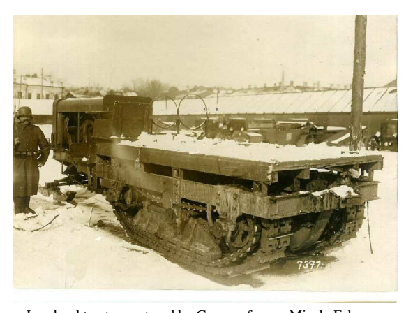
\label{lem:continuous} Lombard\ tractor\ captured\ by\ German\ forces.\ Minsk,\ February, \\ 1918.

Since it appears that records are all but non-existent there wartime history is rather vague. However, that they arrived in time to see frontline service before the complete collapse of the Russian armies and the